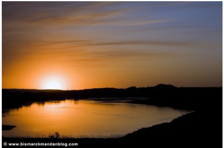
The north end of Double Ditch is one of Bismarck-Mandan's best summer sunset vantage points.

Bismarck-Mandan Blog www.bismarckmandanblog.com