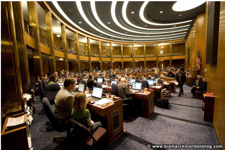
North Dakota's biennial legislature holds a Citizen's Night each year it's in session.

Bismarck-Mandan Blog www.bismarckmandanblog.com